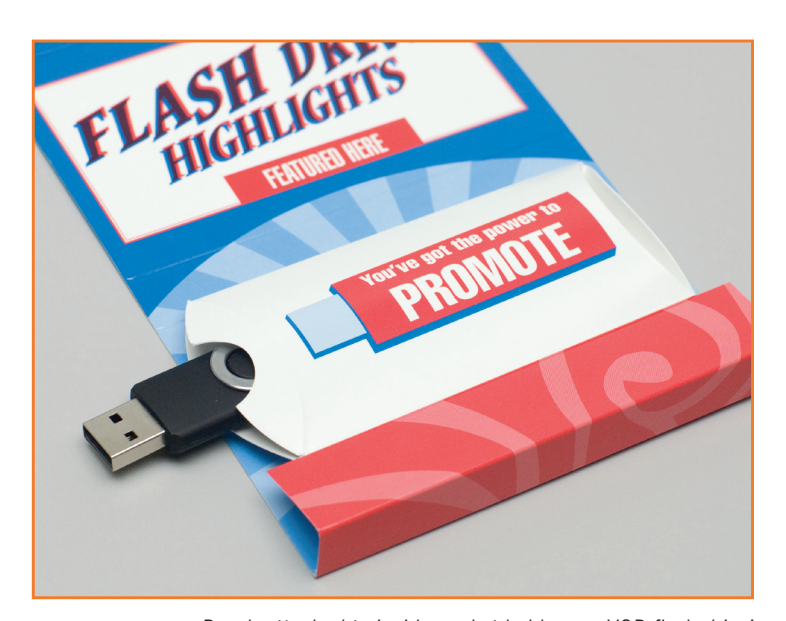
Pouch attached to inside pocket holds your USB flash drive!